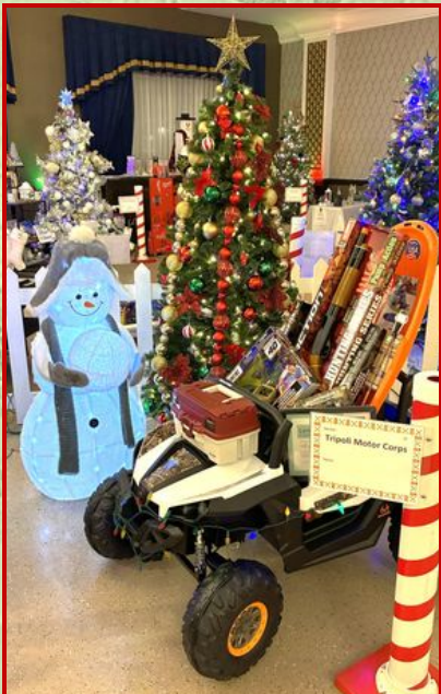
Tripoli Motor Corps