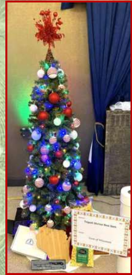
Tripoli Nex Gen "Taste of WI"

Thank You to all our Great Units that Participated!