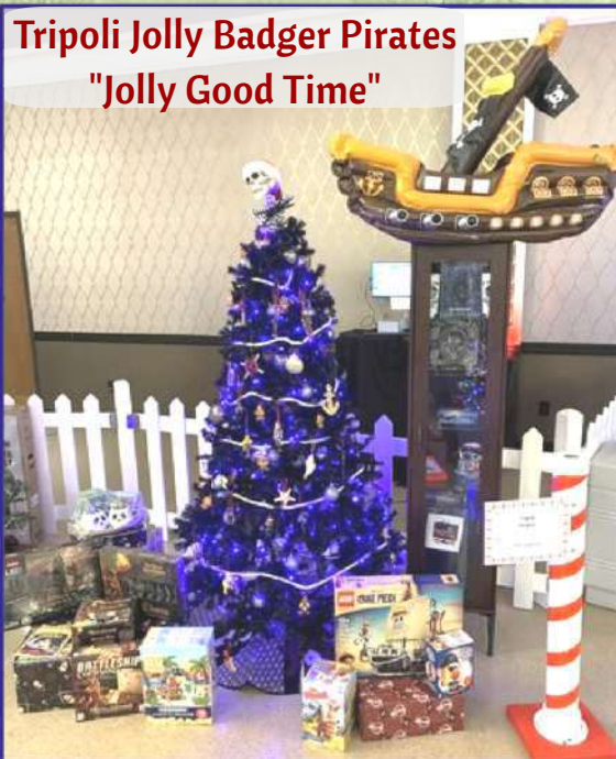
Tripoli Jolly Badger Pirates "Jolly Good Time"

Thank You to all our Great Units that Participated!