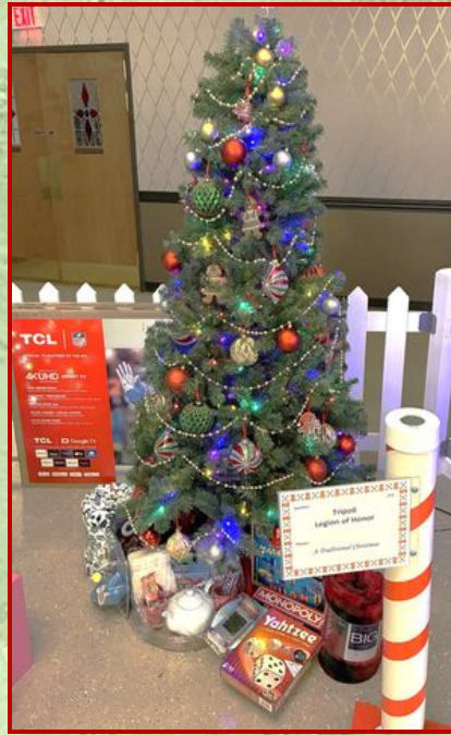
Tripoli Legion of Honor