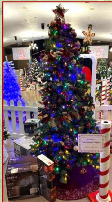
Scimitar Sportsman's Night