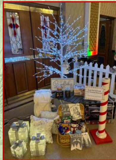
Brew City Fezheads