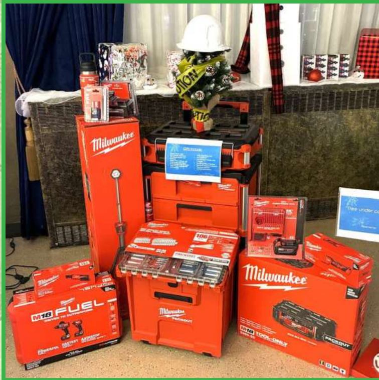
MOST POPULAR TREE Tree 56: Next Level Theme: Tree Under Construction