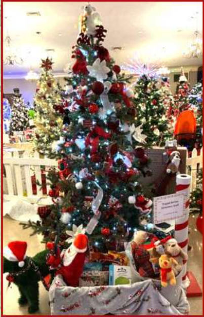
Tripoli Director's Staff