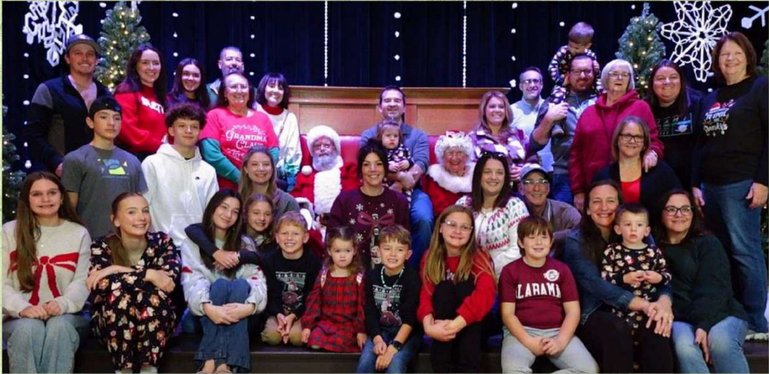
Largest group of visitors 32, 33,... 34 total pictured plus Santa and Mrs Claus.