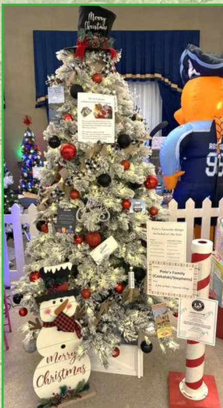
What a Great Tribute to a Shriner