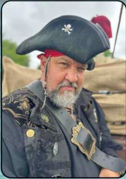
Admiral Curt Campagne