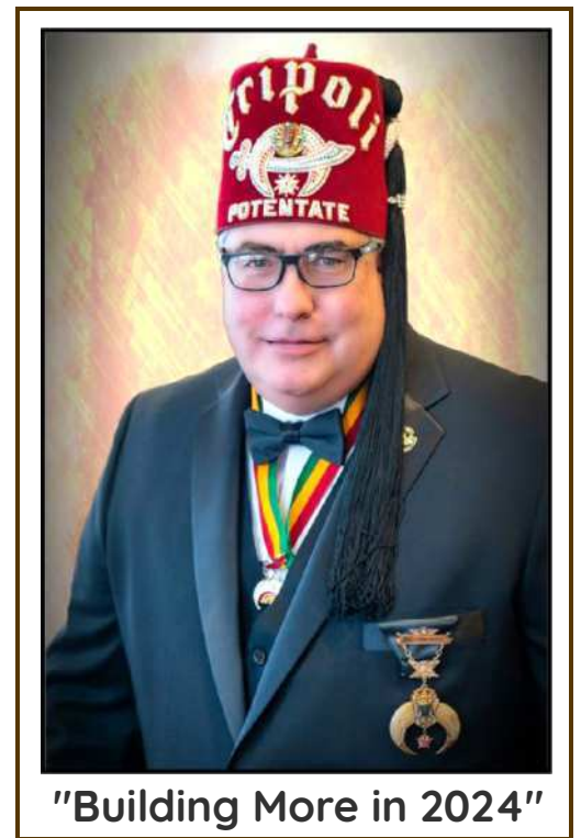
"Building More in 2024"