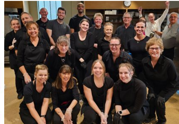
Sportsman's Night cooking and serving staff

WWW.KINGFISHBASEBALL.COM | (262) 653-0900 | 7817 SHERIDAN RD.