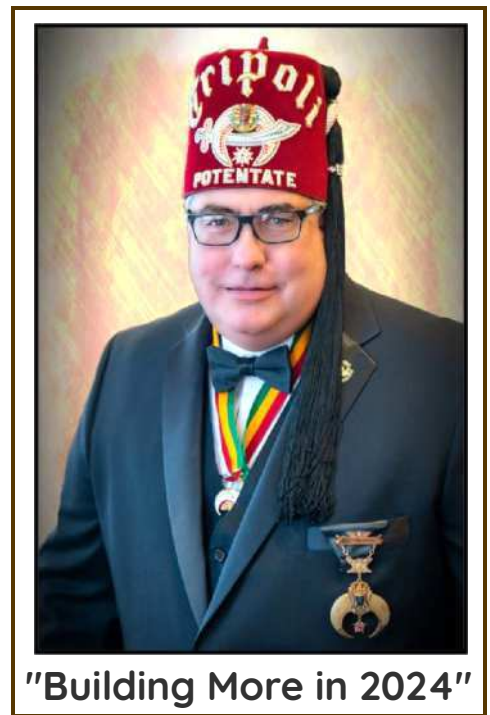
"Building More in 2024"

As the old folklore saying goes about the month of March, "In like a lion and out like a lamb" ... that definitely holds true for things at Tripoli! We kicked off the month with our first parade by attending the Bluemound Road St. Patrick's Day parade. Tripoli was well-represented with the Legion of Honor, Highlanders, Animals and Pirates units, along with the Hillbillies.