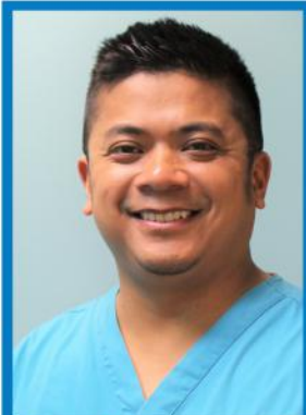
PROUD TRIPOLI SHRINER

6015 W. Forest Home Ave Unit #1 Milwaukee, WI 53220 (414) 604-2055