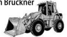
40 Years Experience "Serving The Metro Area"