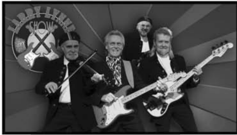
ENTERTAINMENT BY THE LARRY